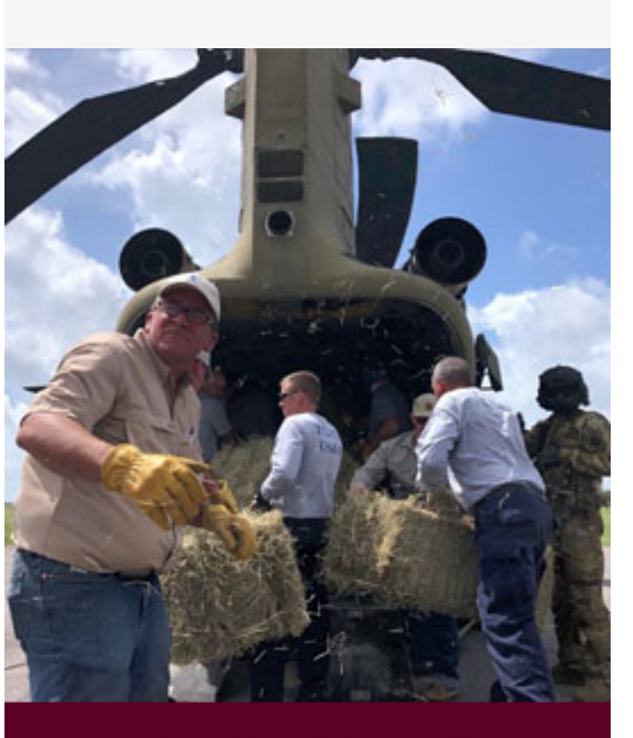
Lending Support In Imelda Aftermath