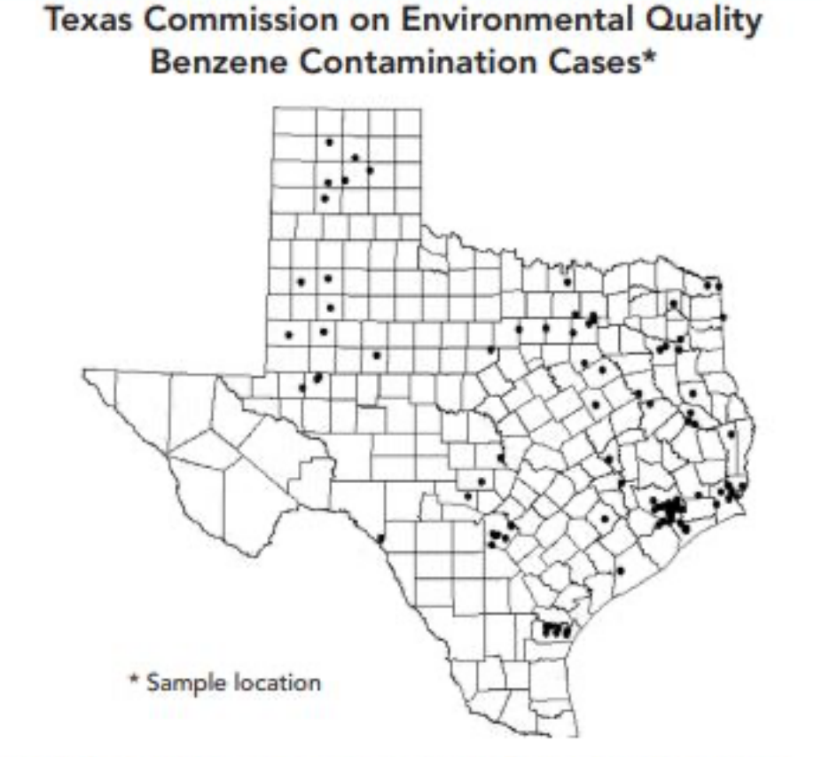
Figure 1: Occurrence of benzene in Texas groundwater. Naturally occurring benzene or contamination cases under the jurisdiction of other regulatory agencies not shown.

Benzene released into soil will volatize quickly or leach into groundwater. A report from the Texas Commission on Environmental Quality identifies locations having benzene contamination of groundwater (Fig. 1). In addition, 37 groundwater contamination cases involving benzene are under the jurisdiction of the Railroad Commission of Texas. Microbes in soil can break down benzene. Benzene released into surface water evaporates in a few hours.